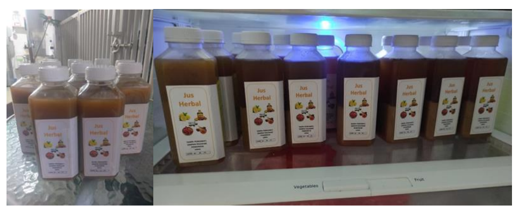
Figure 5 : Packaging and Storage of Herbal Juice Products (Packing & Storage)

Furthermore, on the same day, initial packaging activities with bottles and storage activities in the refrigerator were also carried out so that the product lasts longer.