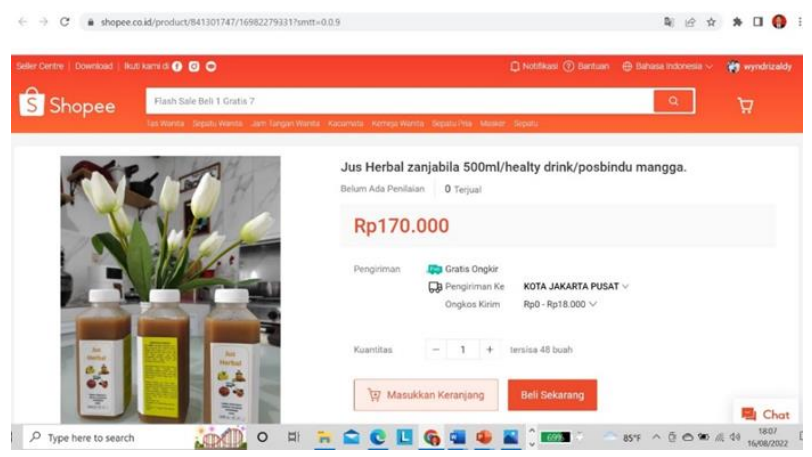
Figure 7: Link and display of herbal juice products in e-commerce shopee

immediately registered herbal juice products through digital e-commerce information technology that was agreed upon as an example of Shopee and would monitor the progress of distribution transactions through the application and report their progress in the third month. The e-commerce business is also a major need for the public in transacting during this pandemic, considering that people are afraid to shop directly so that purchases of some necessities are made online through e-commerce platforms (Sudaryono et al., 2020).