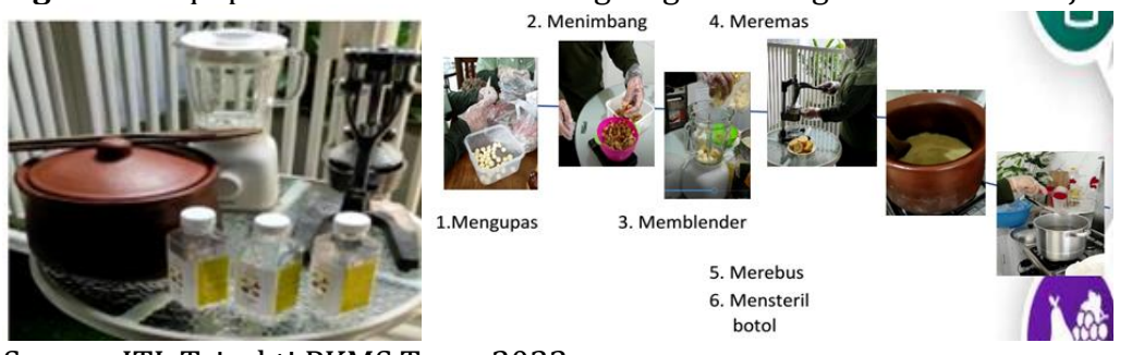
Figure 4: Equipment needed Processing stages of 5 ingredients Herbal juice

In the second session on August 12 or the following day we monitored and received reports from Posbindu cadres, that approximately 20 bottles of herbal juice had been produced, after shopping for ingredients where the main ingredients were single garlic, red ginger, lemon, apple cider vinegar, and honey. and reported processes and production activities can be seen in the image below