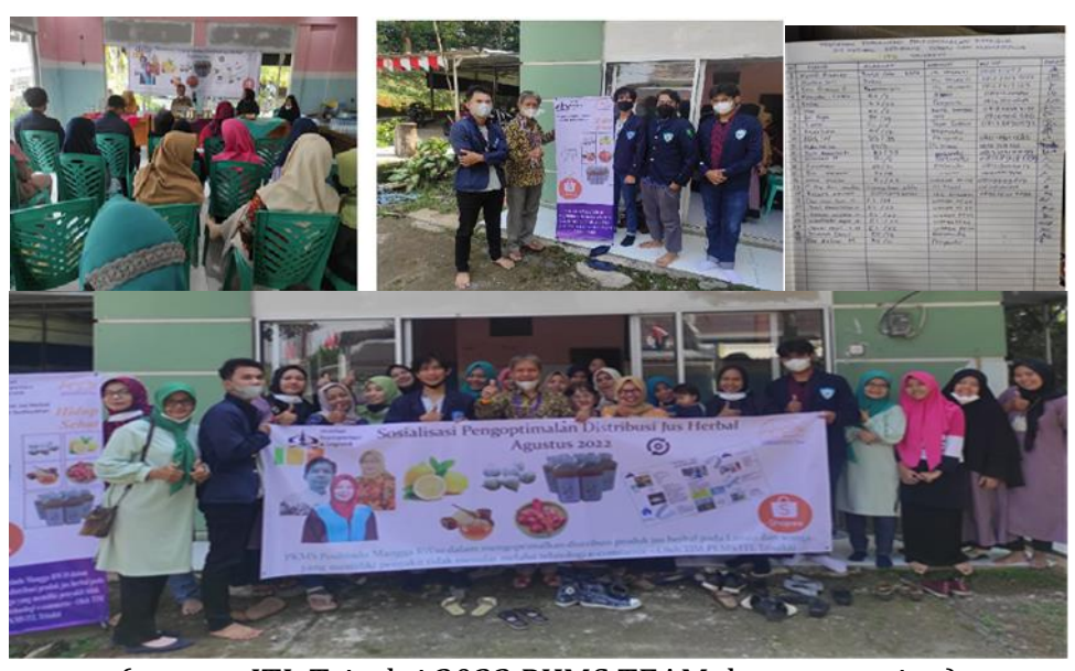
Figure 3 . Photos during the socialization activity, after the socialization and the attendance list of participants on 11 August 2022 at Balai RW10.