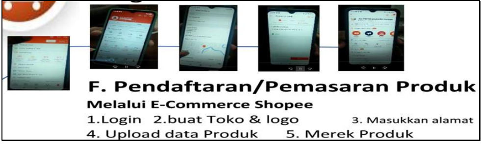
Figure 6: Product registration and marketing through e-commerce shopee

Where the stages of product registration can be seen in the activity figure below