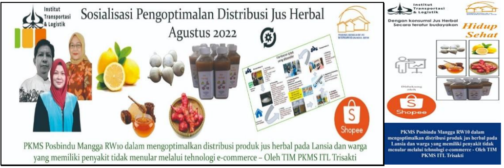
Figure 2 : Banners and banners for socialization and promotion measuring 4 \times 1 meter.

The following are the results of the banner and banner designs that the Service Lecturer Team has used.