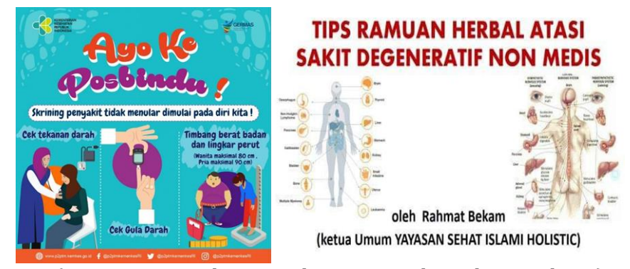
Figure 1: Posbindu Cadre's activity and Herbal Juice Tips