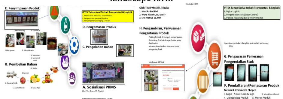
Figure 10 : Poster for the Transfer of Science and Technology for PKMS socialization in landscape form